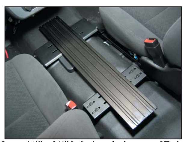
Insert 1/4" x 3/4" bolts into the bottom of Trak. Line up Trak on cross supports where previously marked. Use 1/4" serrated nuts to attach. Reattach Trak with cross supports back onto seat brackets.